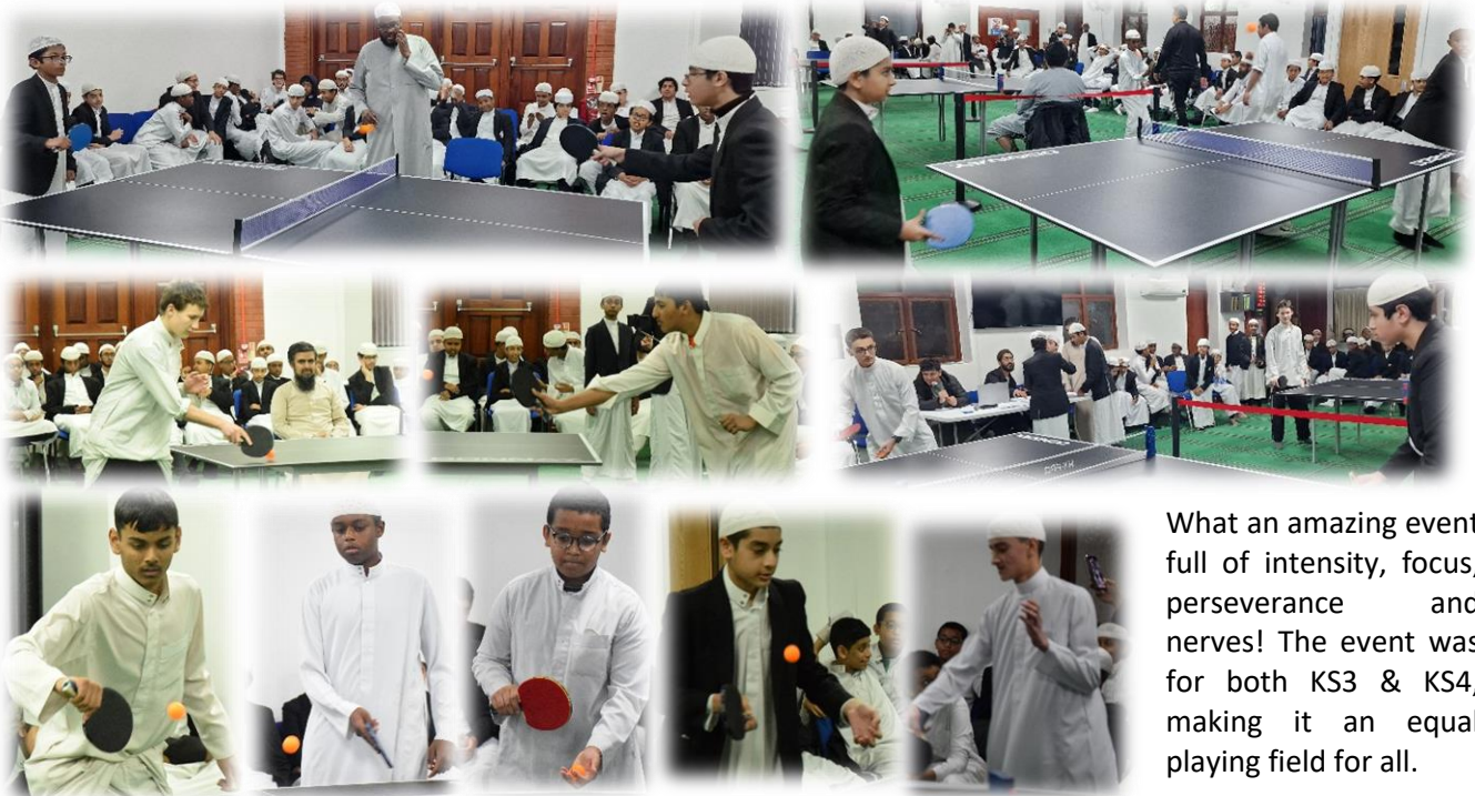
TABLE TENNIS COMPETITION

What an amazing event full of intensity, focus, perseverance and nerves! The event was for both KS3 & KS4, making it an equal playing field for all.